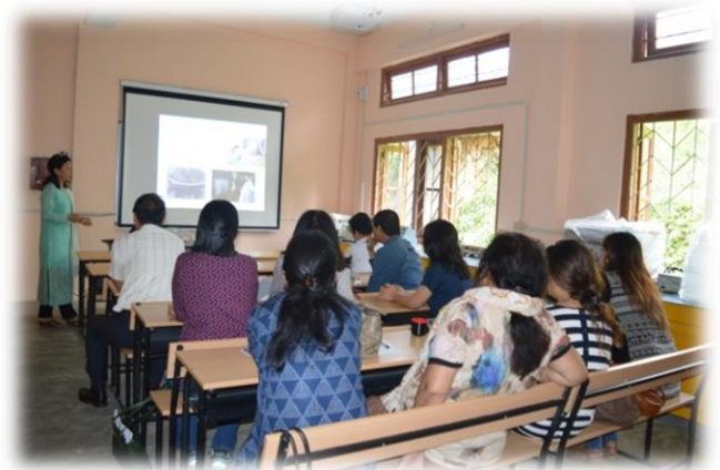
Photo 3: Training program on Mushroom Cultivation for College teachers under VCMC-III on 7 th September 2019.