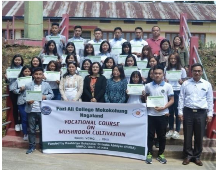
Photo 1: Certificate award program for students successfully completing VCMC-I and VCMC-II on 28 th March 2019.