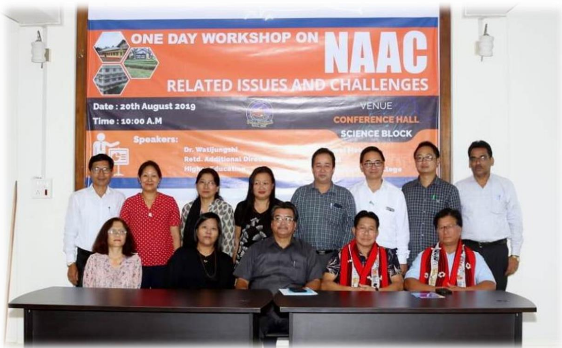
One Day Workshop on “NAAC related Issues and Challenges”