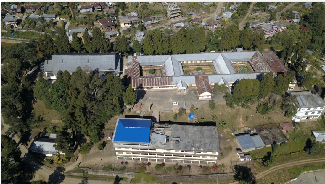
Bird's eye view of Fazl Ali College Mokochung