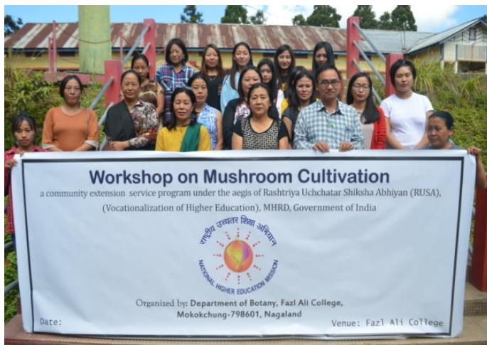
Photo 2: Training program on Mushroom Cultivation for 16 women under VCMC-III on 27 th October 2018.