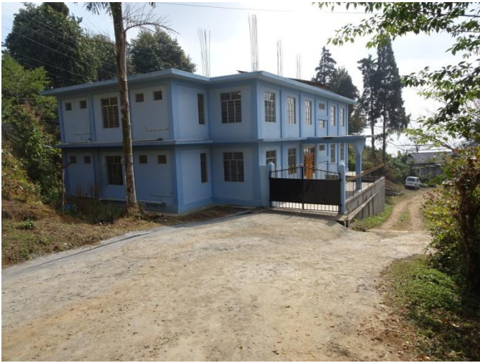
1. Commerce building