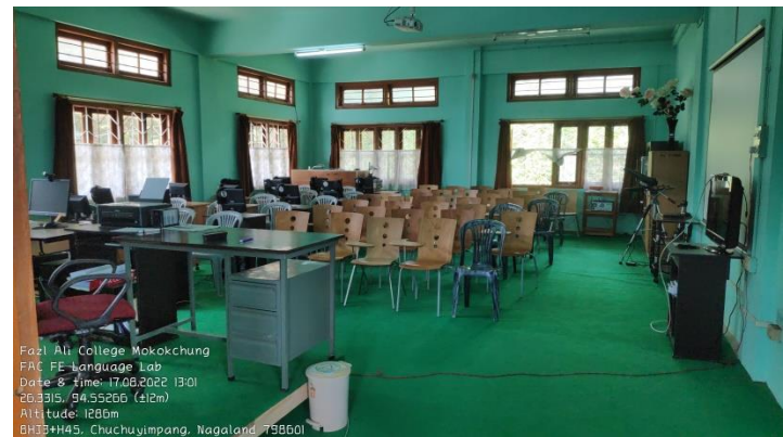
Functional English Language Lab