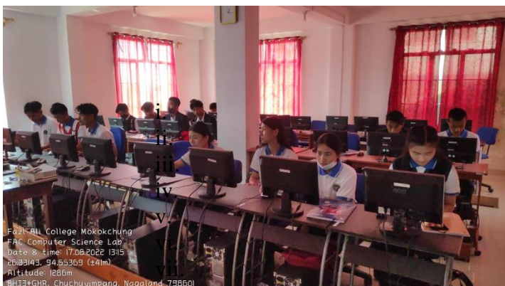
Computer Science Lab