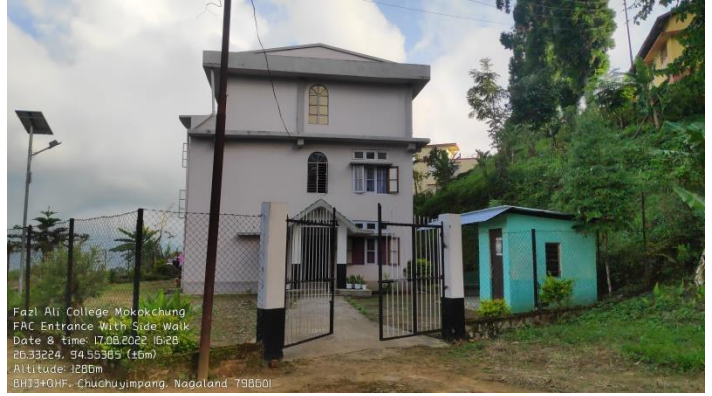
Athena Hostel with Guard Room