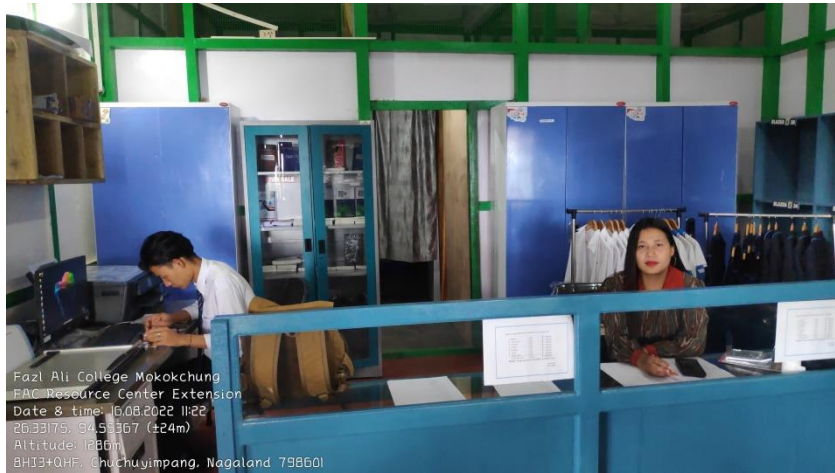
Fazl Ali College Mokokchung FAC Resource Center Extension Date & time: 16.08.2022 11:22 26.33179, 94.55367 (±24m) Altitude: 1286m 8HJ3+QHF, Chuchuyimpang, Nagaland 798601