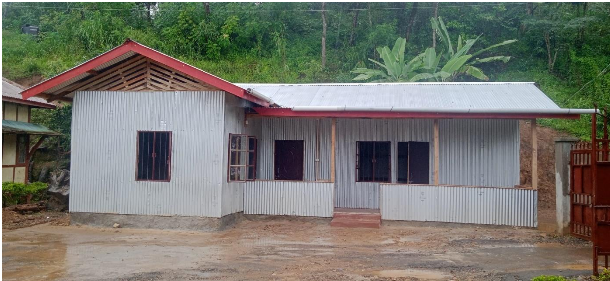
14 bedded Valley View Hostel extension