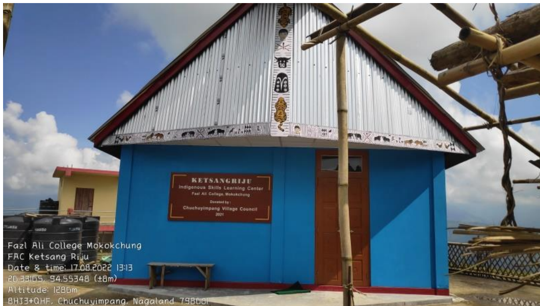
Fazi Ali College Mokochung FAC Ketsang Riju Date & time: 17.08.2022 13:13 26.3316, 94.55348 (+8m) Altitude: 1280m BH13+QHF, Chuchuyimpang, Nagaland 798601