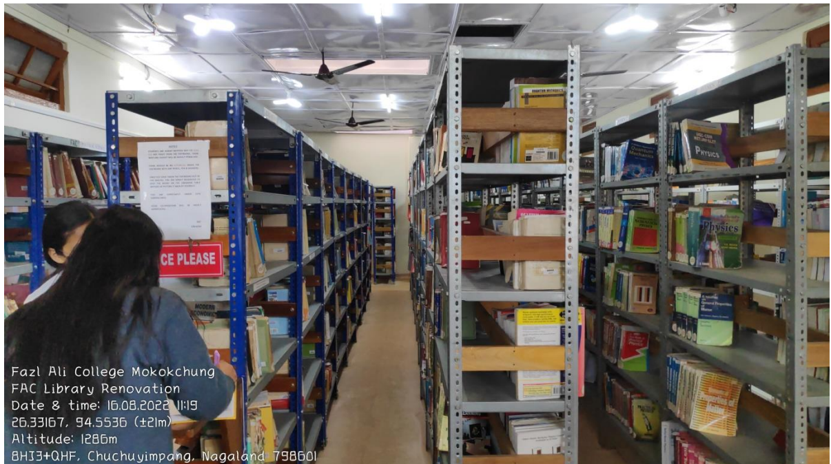
Fazl Ali College Mokokchung FAC Library Renovation Date & time: 16.08.2022 11:19 26.33167, 94.55356 (±21m) Altitude: 1286m 8HJ3+QHF, Chuchuyimpang, Nagaland 798601