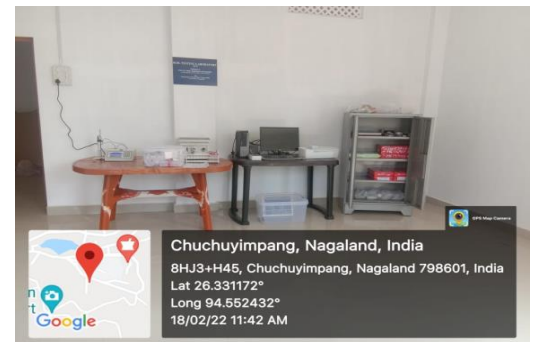
Soil Testing Lab (Geography)