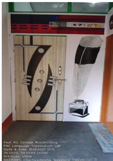
Fazl Ali College Mokokchung FAC Language Translation Lab Date & time: 16.08.2022 13:15 26.33179, 94.55319 (±22m) Altitude: 1285m 8HJ3+H45, Chuchuyimpang, Nagaland 798601