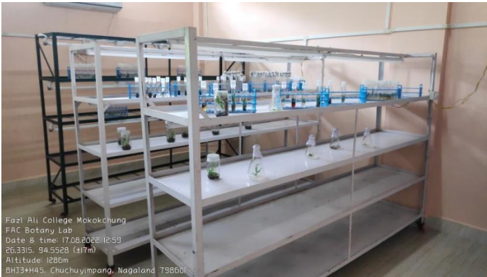
Fazi Ali College Mokochung FAC Botany Lab Date & time: 17.08.2022 12:59 26.3316, 94.5528 (+17m) Altitude: 1280m BH13+H45, Chuchuyimpang, Nagaland 798601