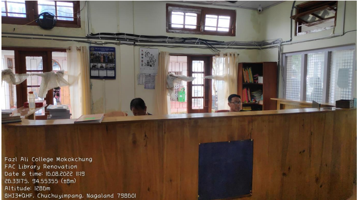
Fazl Ali College Mokokchung FAC Library Renovation Date & time: 16.08.2022 11:19 26.33175, 94.55355 (±8m) Altitude: 1286m 8HJ3+QHF, Chuchuyimpang, Nagaland 798601