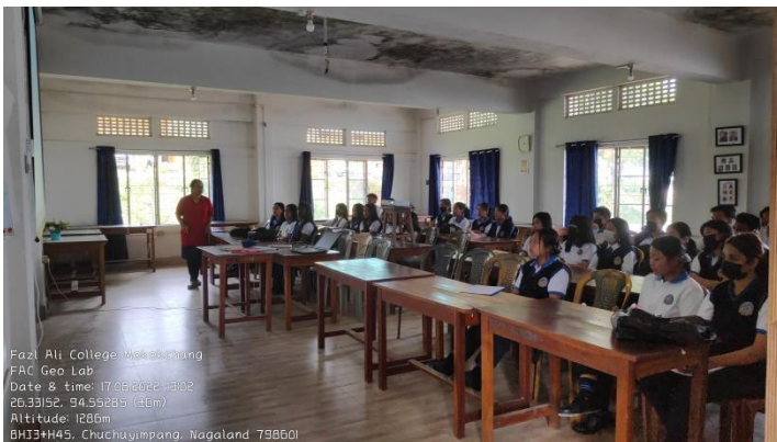
Geography Class Lab