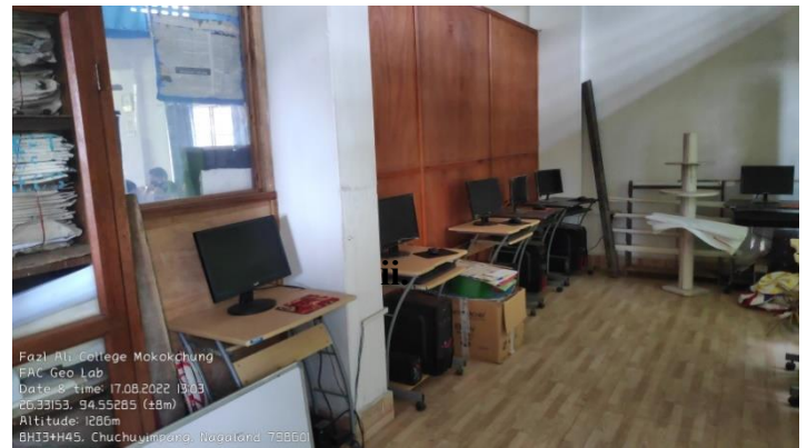
Geography GIS Lab