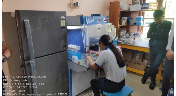
Fazi Ali College Mokochung FAC Botany Lab Date & time: 17.08.2022 12:59 26.3316, 94.5528 (+15m) Altitude: 1280m BH13+H45, Chuchuyimpang, Nagaland 798601