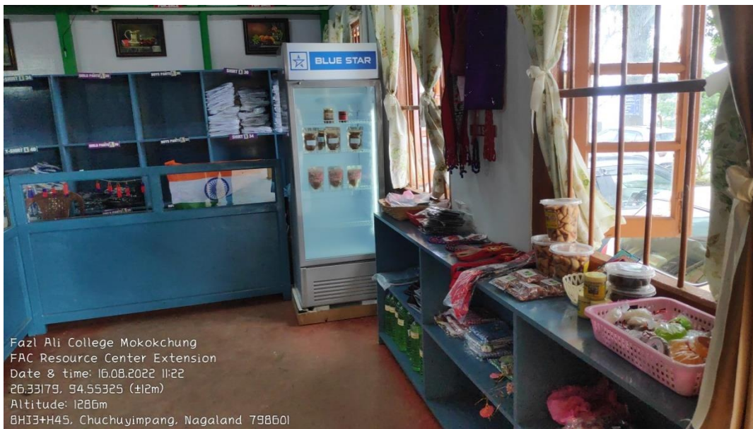
Fazl Ali College Mokokchung FAC Resource Center Extension Date & time: 16.08.2022 11:22 26.33179, 94.55325 (±12m) Altitude: 1286m 8HJ3+H45, Chuchuyimpang, Nagaland 798601