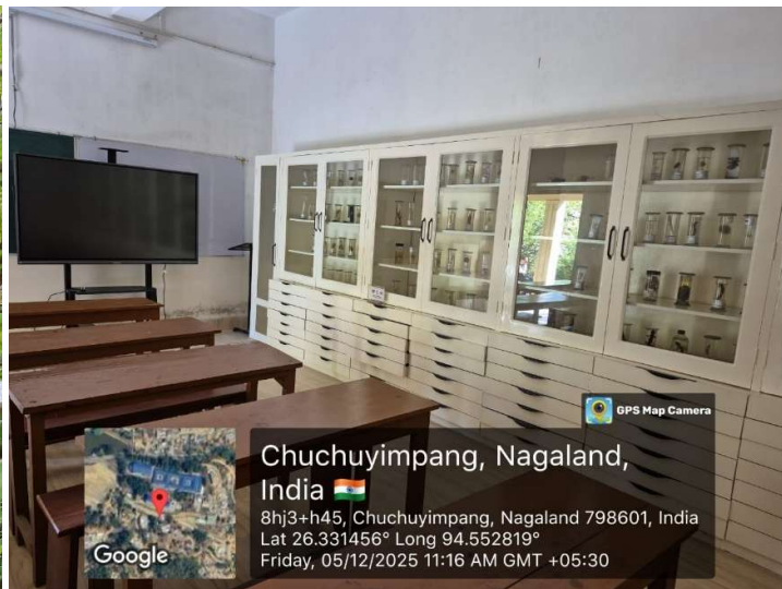
Aviary and Entomology Museum under the Dept of Zoology