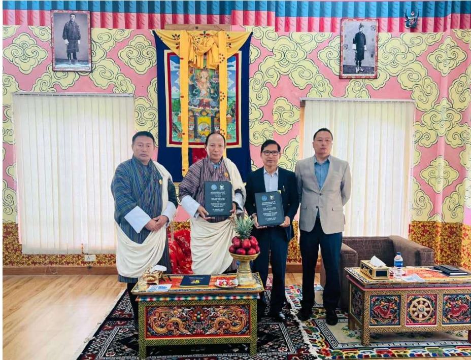
MoU signed with the Sherubtse College Royal University of Bhutan