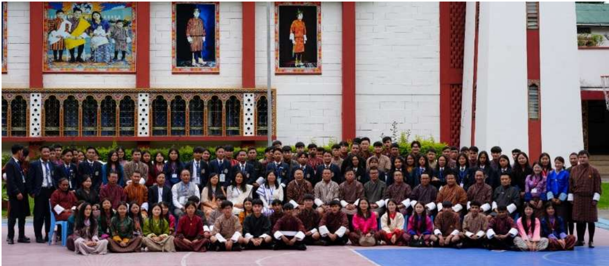
3-Day Academic and Cultural Exchange Programme between Fazl Ali College, Mokokchung and Sherubtse College, Royal University of Bhutan