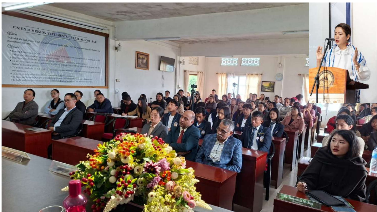
First FAC Annual Lecture held on the theme: “Quality Education for Indigenous Research and Nation Building”